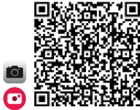
Meta Quest 2

1. Scan Collectq QR Code above to get started